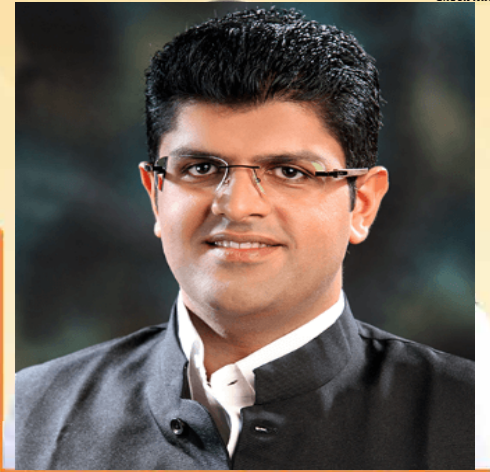
DUSHYANT CHAUTALA Deputy Chief Minister, Haryana