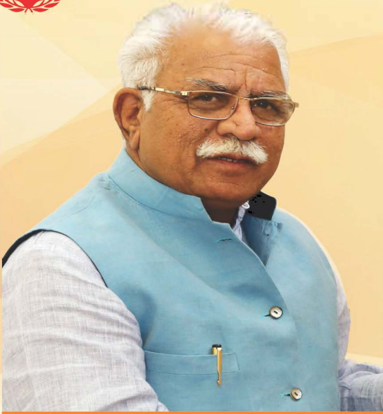
MANOHAR LAL Chief Minister, Haryana